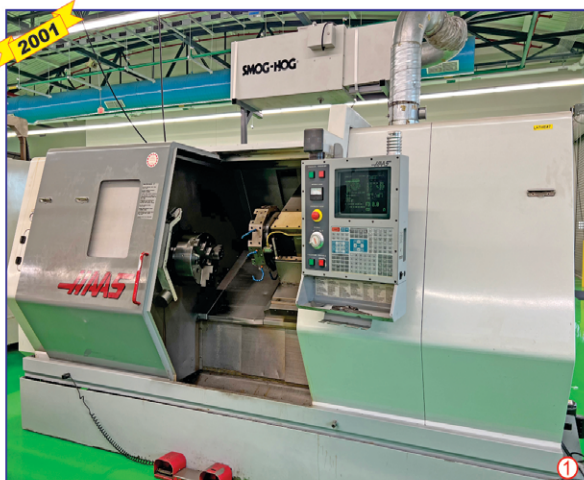
Haas SL-40T CNC Slant Bed Lathe