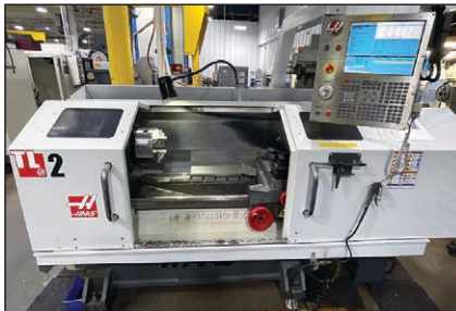
Haas Mdl.TL2 CNC Lathe