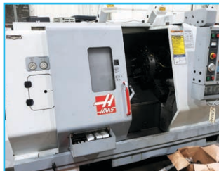
10" x 20" Haas SL-20T CNC Turning Center w/Live Tooling