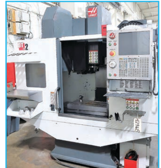
Haas DT-2 4-Axis CNC Drill/Tap Vertical Machining Center

BEGINS: TUES, MARCH 28TH • 9:00 AM CST ENDS: WED, APRIL 12TH • 10:00 AM CST