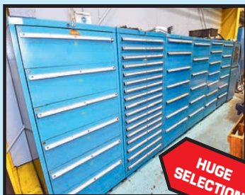
ROLLER DRAWER TOOL CABINETS

DAY 2: THURSDAY, APRIL 13 • TIMED ONLINE AUCTION • BIDS START CLOSING AT 11:00 A.M. EDT