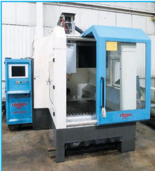
Roders RFM 1000 High Speed 3-Axis CNC Vertical Machining Center

75 E Palatine Road Prospect Heights, IL 60070