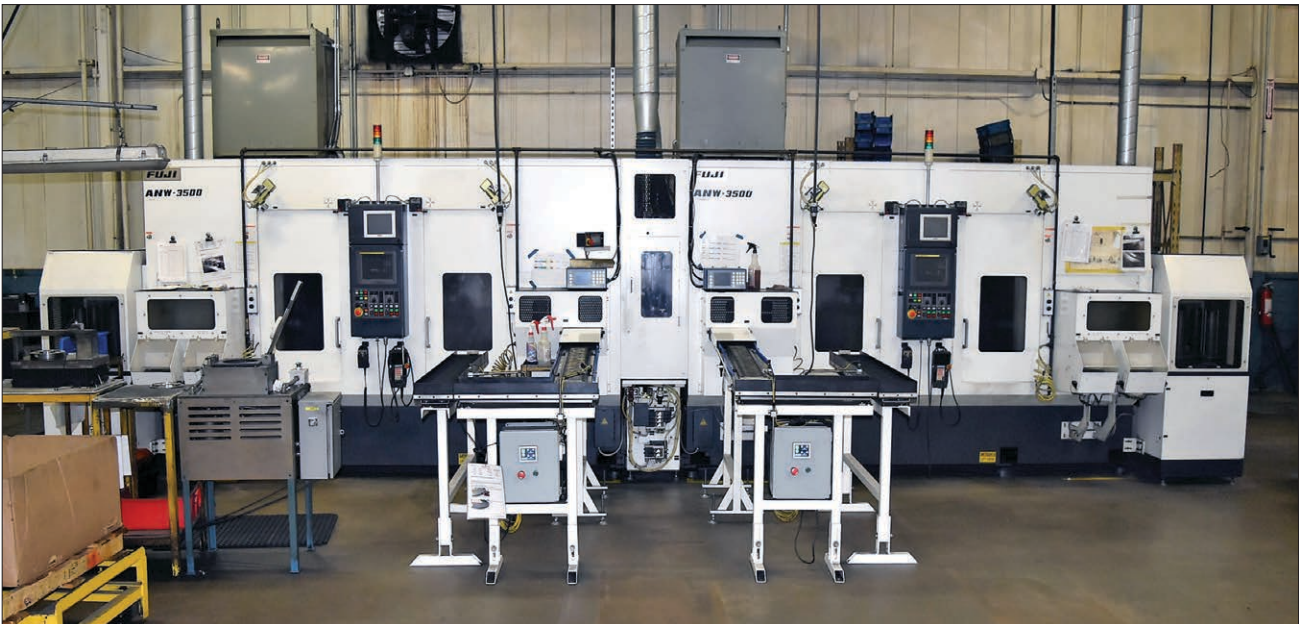
Fuji ANW-3500 Twin Spindle Lathe

FEATURING: CNC Vertical Milling • CNC Vertical Machining • CNC Turning • Broaching • Lapping • Double Disc Grinding • Single Side Grinding • Fine Grinding • Centerless Grinding • Deburring • Brushing • Heat Treating • Water Chilling System • MRO