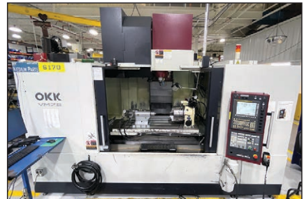
OKK Mdl. VM7III CNC Vertical Machining Center