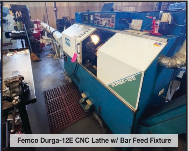
Femco Durga-12E CNC Lathe w/ Bar Feed Fixture