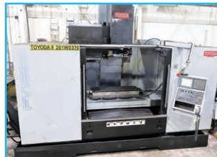
Toyota VF1680 Heavy Duty 50-Taper CNC Vertical Machining Center