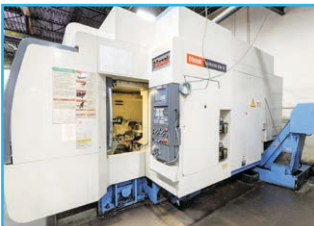
Mazak Variaxis 630 5-Axis CNC Vertical Machining Center