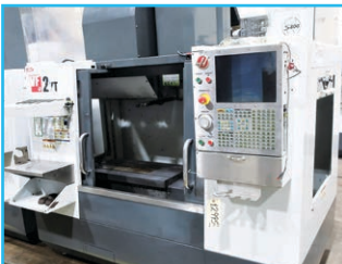
Haas VF2-YT CNC 3-Axis Vertical Machining Center