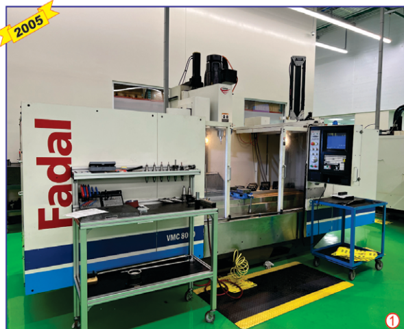
Fadal VMC 8030 CNC Vertical Machining Center

Featured Machines: 2005 Fadal VMC 8030 HT, Fadal 917 VMC 5020A, Hitachi Seiki VK55 II CNC VMC, Fadal 914-15 VMC 15, 2007 Mori Seiki DuraVertical 5100 CNC VMC, 2001 Haas SL-40T CNC Lathe, Hitachi Seiki HITEC-TURN 25S CNC Lathe, Mori Seiki SL-300BMC CNC Lathe, (2) Mori Seiki SL-65 MC CNC Turn/Mill Centers, Fortune Vturn-36 CNC Lathe, Victor Vturn-26 CNC Lathe, Studer S31 CNC Universal Cylindrical Grinder, Ewag EWAMATIC 6 Axis CNC Tool Cutter & Grinder, Mazak Slant Turn 80N CNC Hollow Spindle Lathe (21.5" Bore), Weiler E90 CNC Hollow Spindle Lathe (14" Bore), Kingston CL38-3000 CNC Lathe (7.3" Bore), 2010 Nexturn LP 18D Swiss Type Dual Spindle CNC Lathe, 2005 Brother Model HS-70A CNC Wire EDM, Engine Lathes, Mill, and Drills