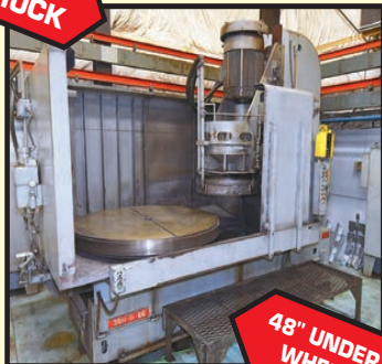
BLANCHARD MDL. 36HD-66 VERTICAL ROTARY SURFACE GRINDER