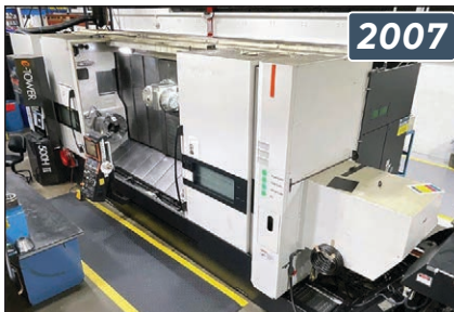
Mazak Integrex E550HII CNC Turning and Milling Center