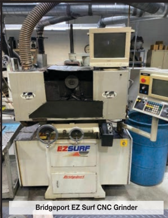
Bridgeport EZ Surf CNC Grinder