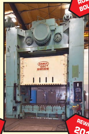
DANLY MDL. S2-800-120-60 QDC 800 T. STRAIGHT SIDE PRESS