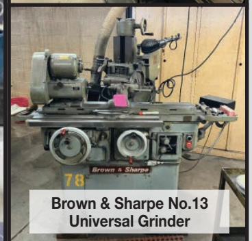
Brown & Sharpe No.13 Universal Grinder