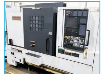
Mori Seiki NL2500SY700 CNC Lathe Turning Center

Visit Our Website for Listing, Updates, and Photos www.premierarg.com