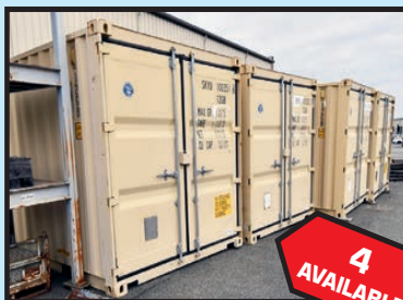
10' CONEX BOXES