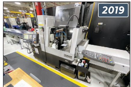
Tsugami SS327-5AX, 7 Axes Swiss Type CNC Lathe