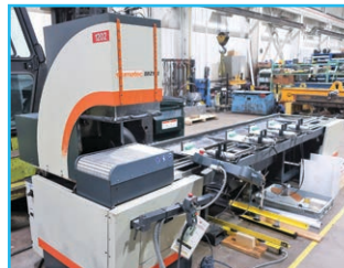
Elumatec SBZ-122/10 CNC Profile Machining Center/Router