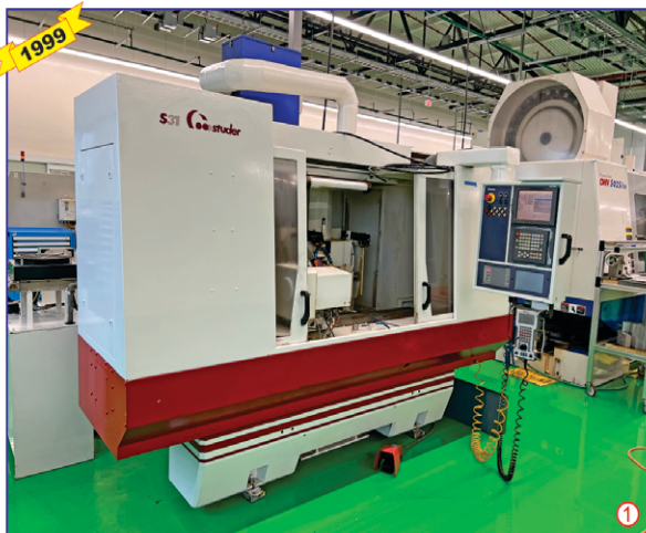
S31 Studer CNC Universal Cylindrical Grinder