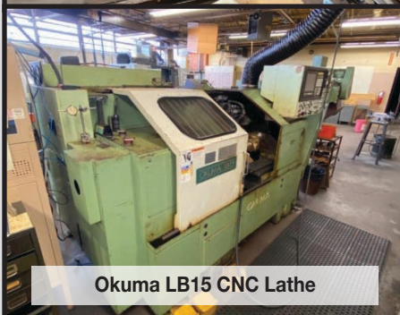
Okuma LB15 CNC Lathe