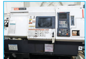
Mazak QTN-250MSY CNC Lathe w/Sub Spindle