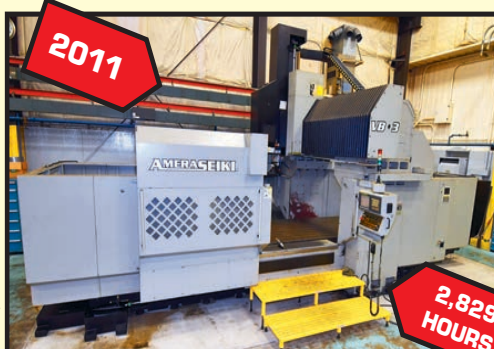
AMERA-SEIKI MDL. VB-3 BRIDGE TYPE VERTICAL MACHINING CENTER