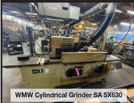
WMW Cylindrical Grinder SA 5X630