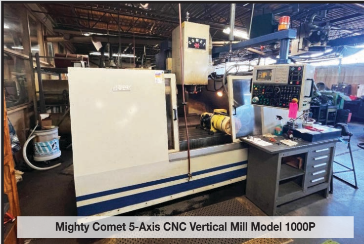
Mighty Comet 5-Axis CNC Vertical Mill Model 1000P

32301 Dequindre Rd., Madison Heights, MI 48071 • 32388 Edward Ave., Madison Heights, MI 48071