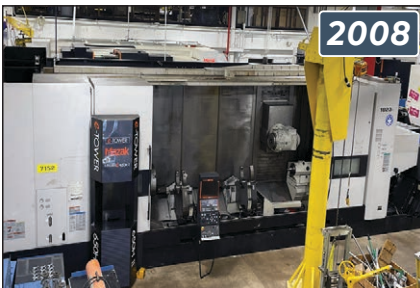
Mazak Integrex E650HII CNC Turning and Milling Center

INSPECTION: By Appointment Only – Contact Link Auctions