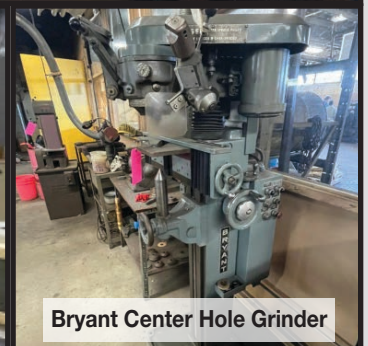
Bryant Center Hole Grinder