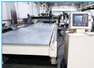
7' x 25' Motion Master MB-725C Heavy Duty 3-Axis CNC Router