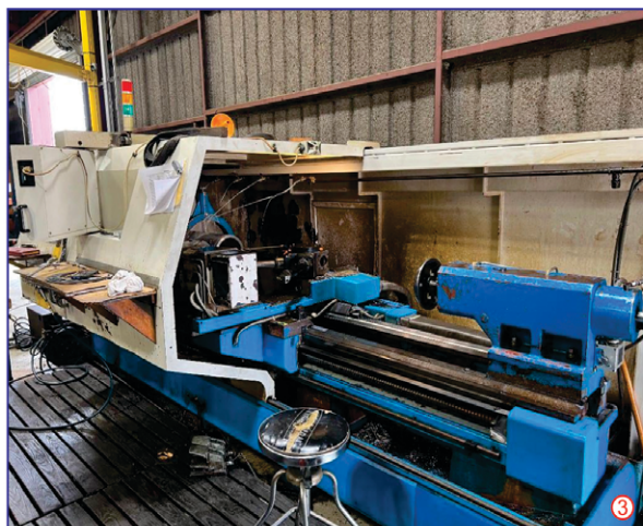
Kingston CL38-3000 CNC Lathe with 7.3" Spindle Bore