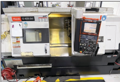
Mazak Quick Turn Nexus 350-11 CNC Lathe